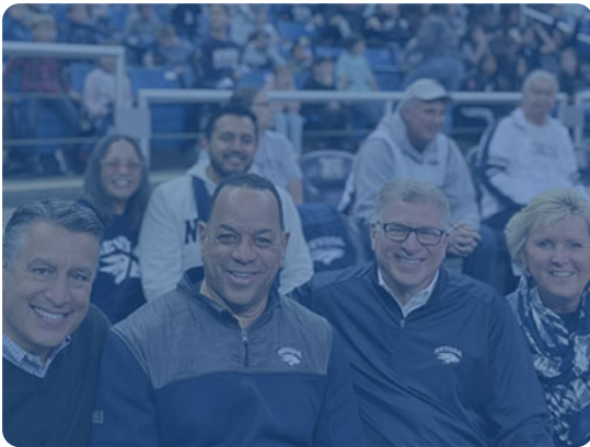
PARTNERS IN EDUCATION