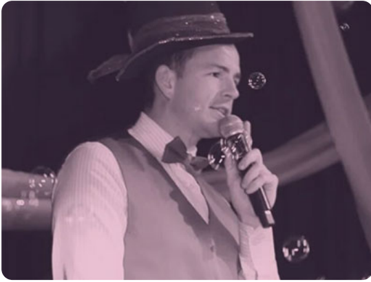
AN EVENING OF PURE IMAGINATION