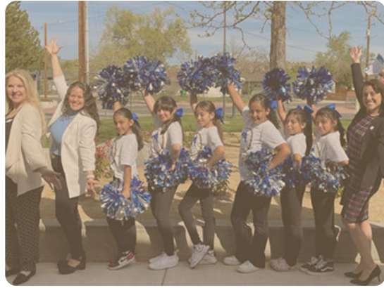
CARING FOR CLASSROOMS