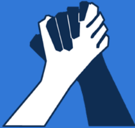
Partners in Education (PiE)