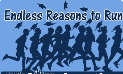
education Alliance runforeducation